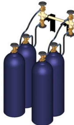
Vertical Crossover 10" on Centers