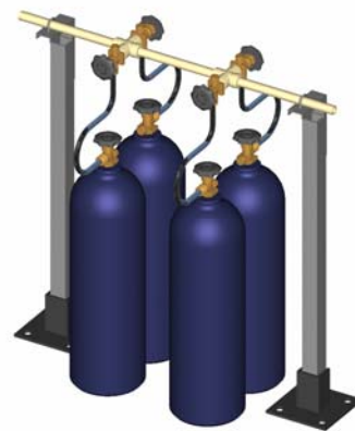
Crossover 10" on Centers Floor Stand Required