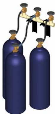
Staggered 5" on Centers